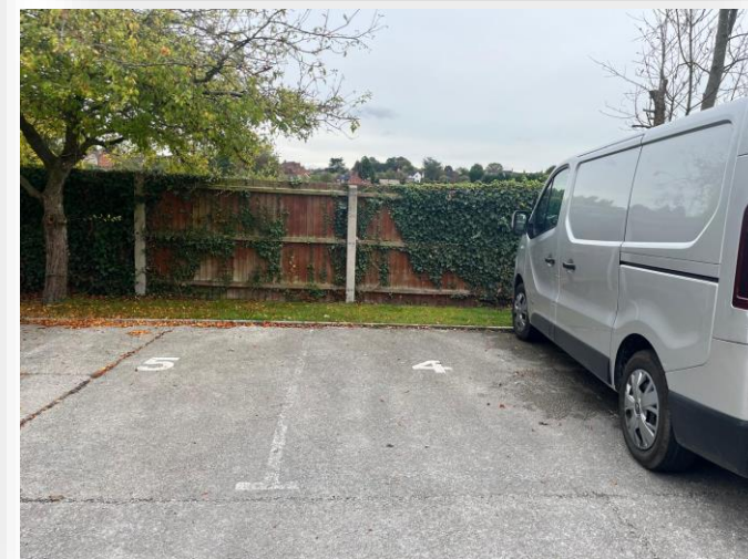
Vernon House Balance Street, Uttoxeter ST14 8JB