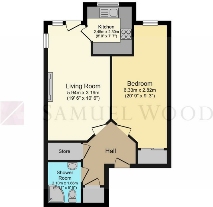
Floor Plan Floor area 51.6 sq.m. (555 sq.ft.)

Total floor area: 51.6 sq.m. (555 sq.ft.)