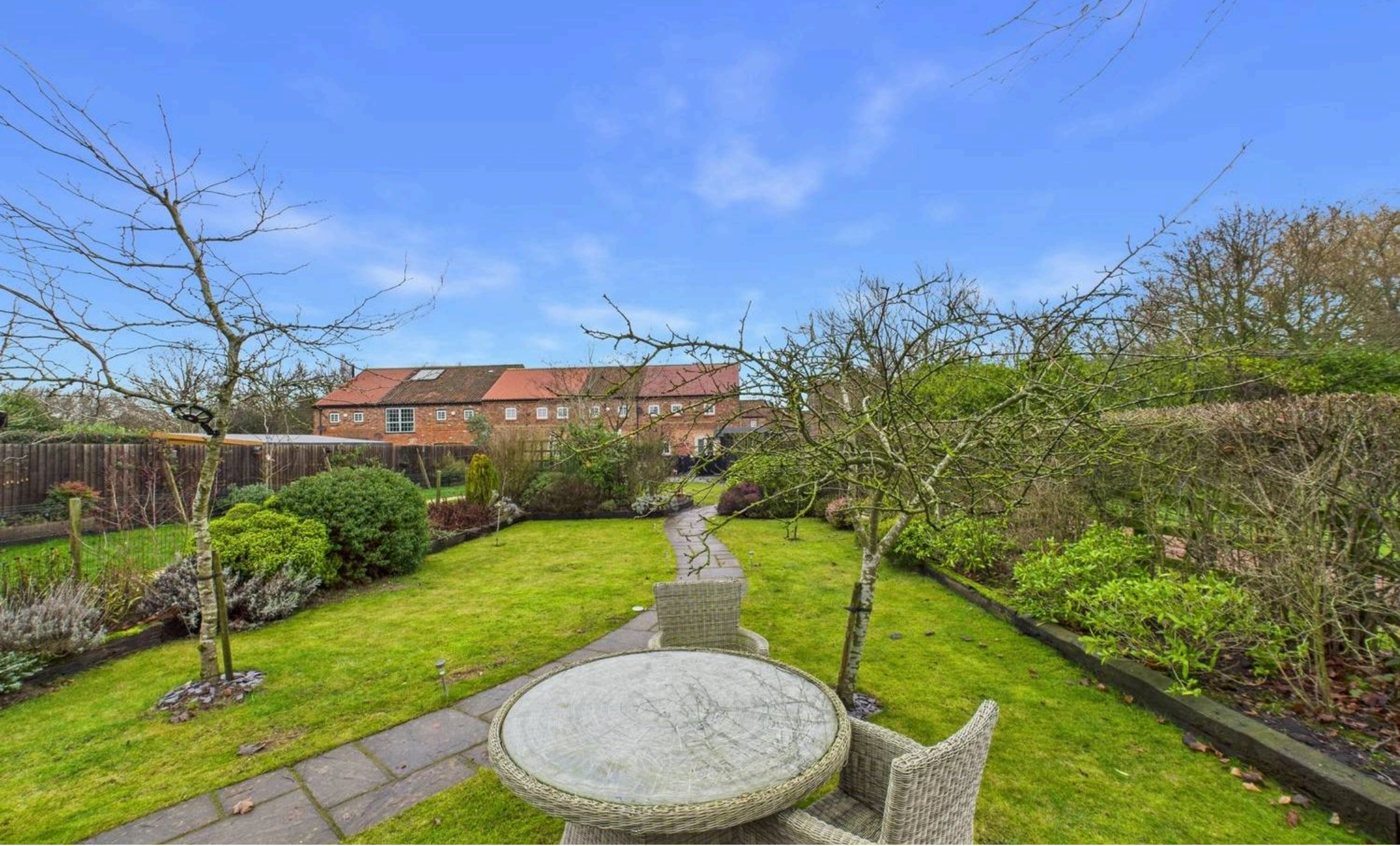
Barn Hill Farm, Howden, DN14 7JG £375,000