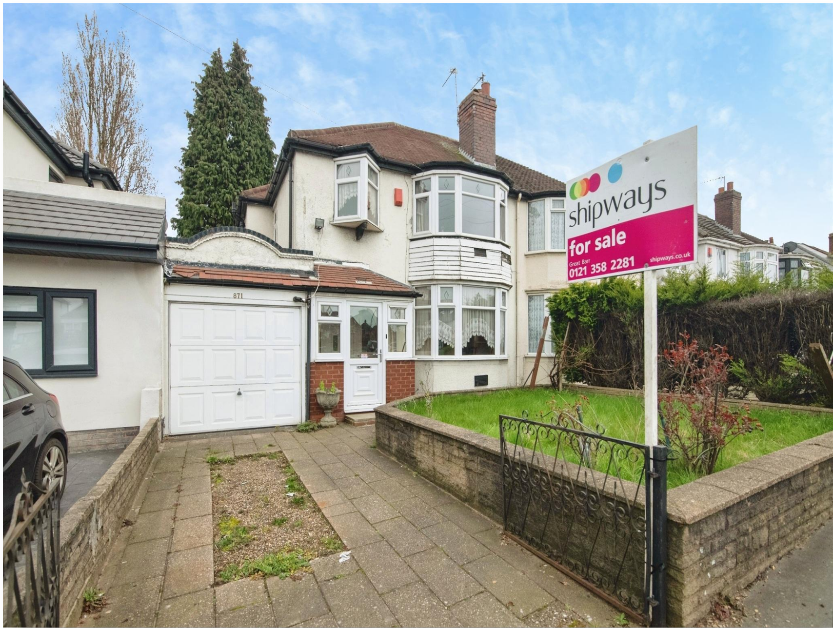
Walsall Road, Great Barr Birmingham B42 1ER