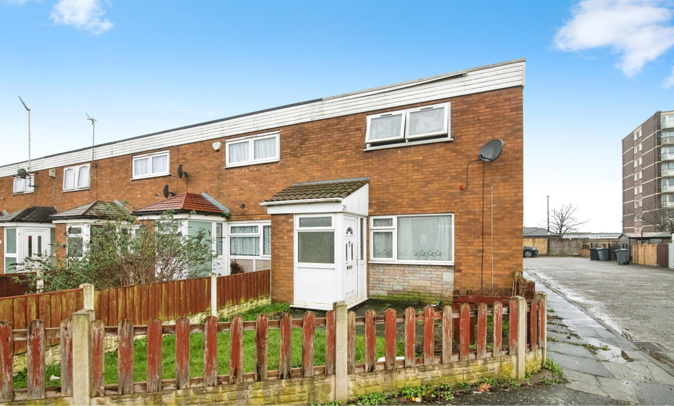
Arthur Street, Sandwell WEST BROMWICH B70 6NR