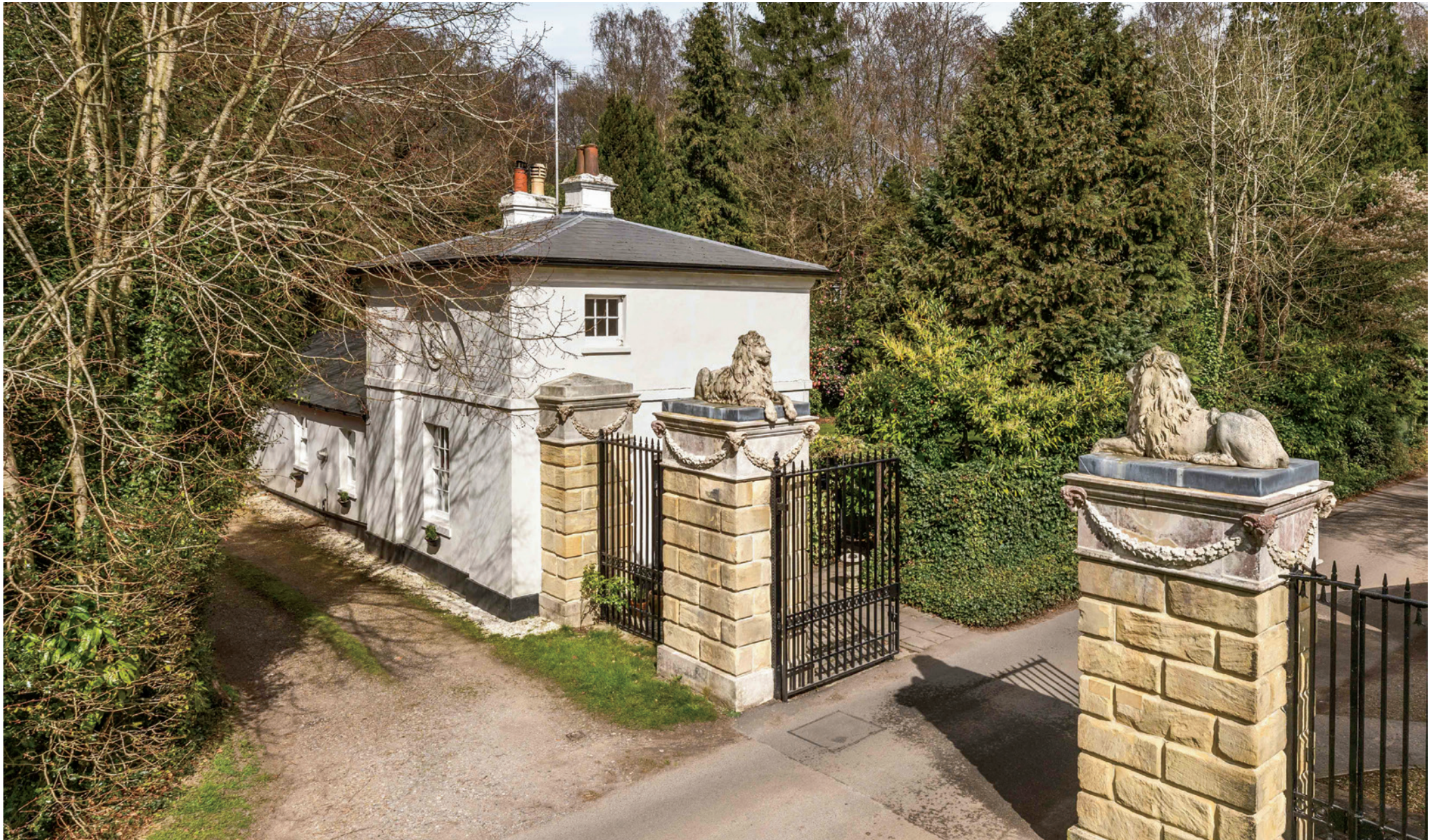
Lion Lodge North The Avenue | Brentwood | Essex | CM13 3RZ