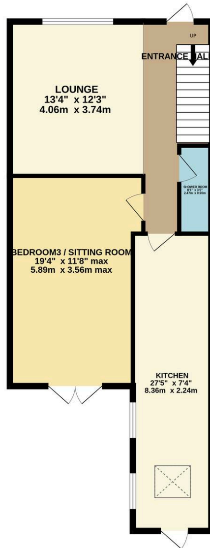
GROUND FLOOR 718 sq.ft. (66.7 sq.m.) approx.