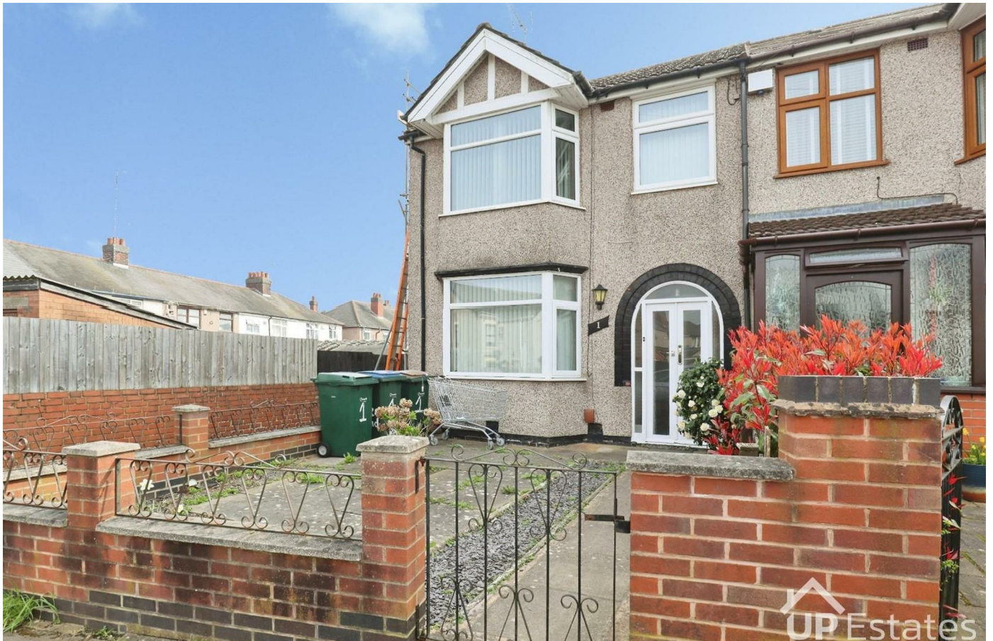
Alder Road, Coventry