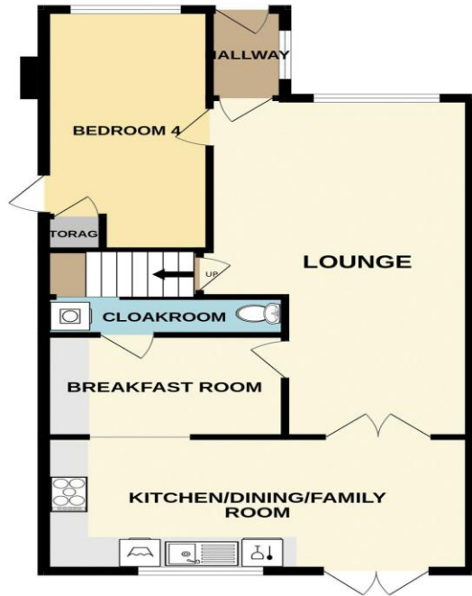
GROUND FLOOR 966 sq.ft. (89.8 sq.m.) approx.