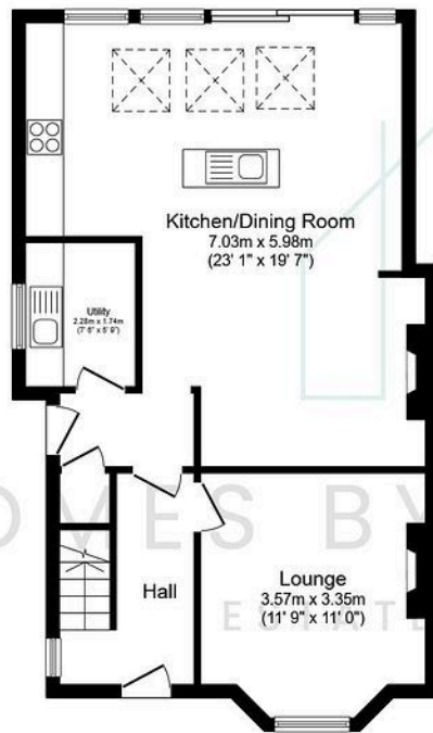
Ground Floor Floor area 63.4 sq.m. (683 sq.ft.)