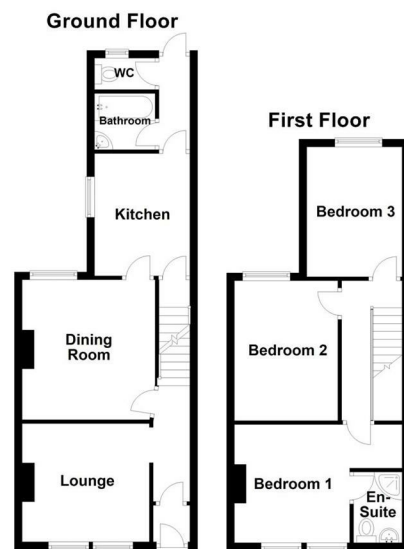
Not to scale. For illustrative purposes only

All photographs displayed are the exclusive property of Richard Greener Estate Agents. They are protected under international copyright laws. No photograph may be copied, reproduced, distributed,