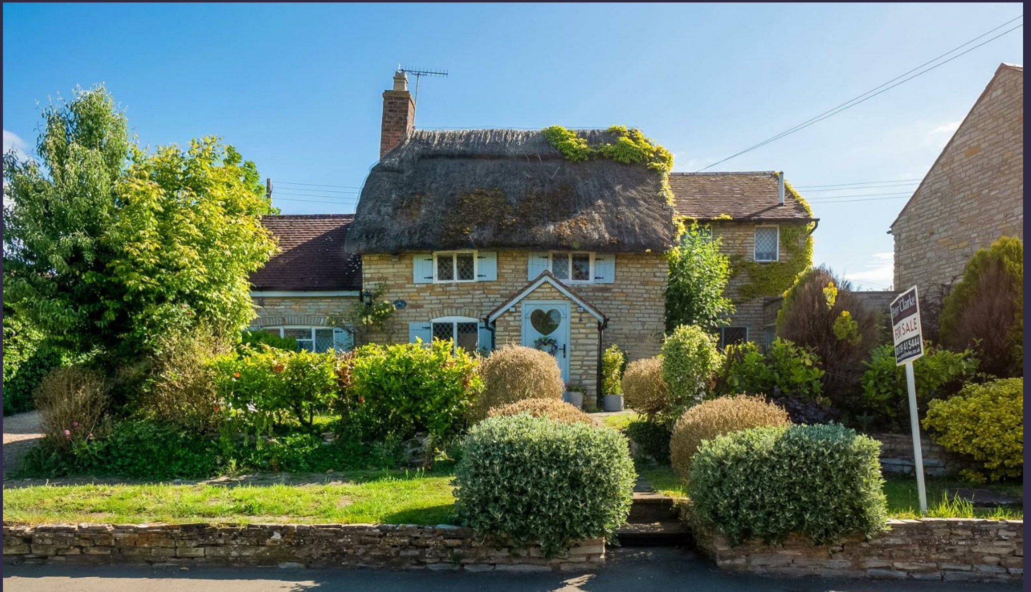
Little Dene Cottage, 170 Binton, Stratford-upon-Avon, CV37 9TW