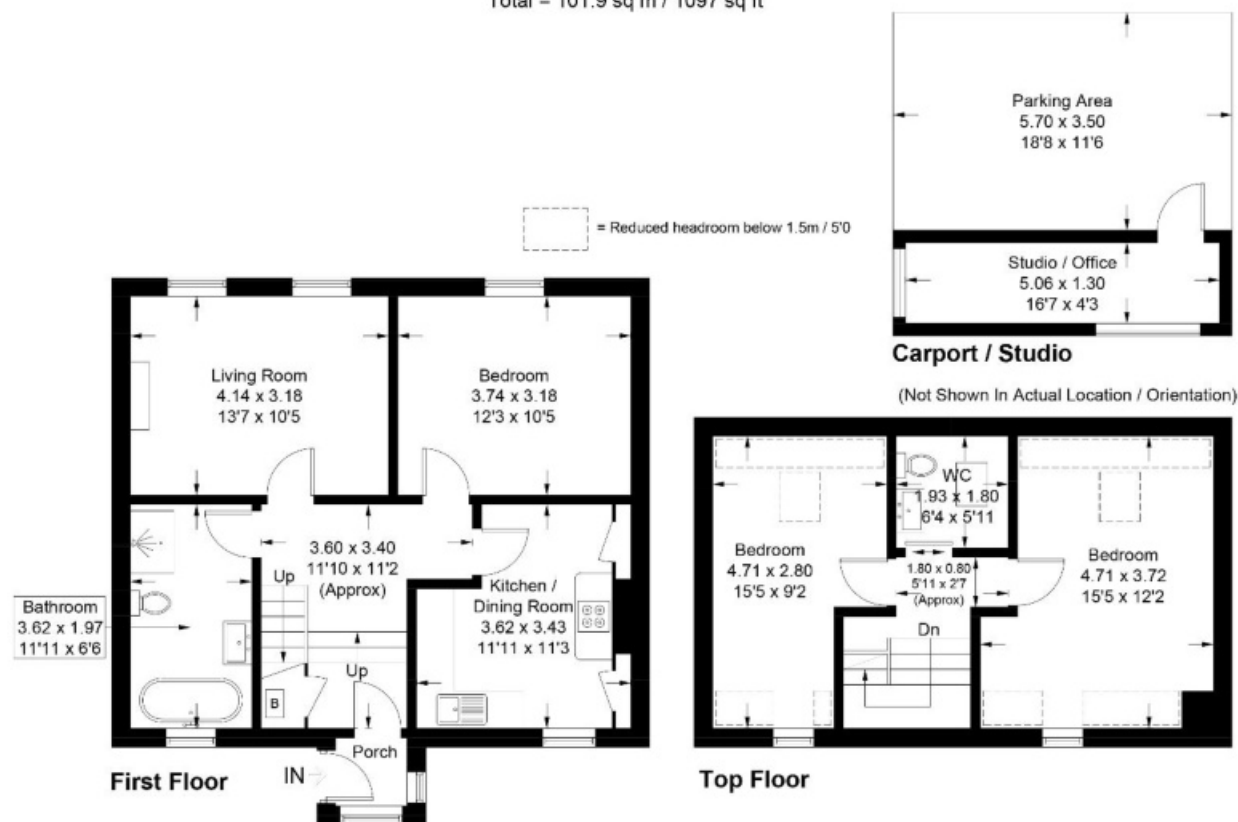
Illustration for identification purposes only, measurements are approximate, not to scale. Fourlabs.co © (ID1301467)