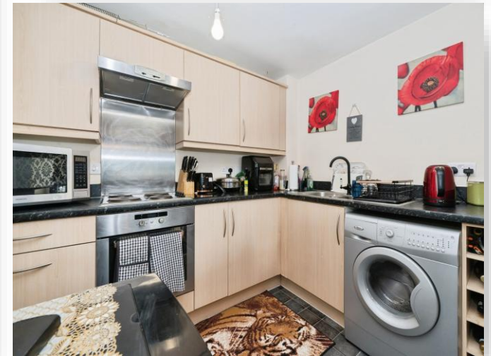
Alexander Square, Eastleigh, SO50 4BW