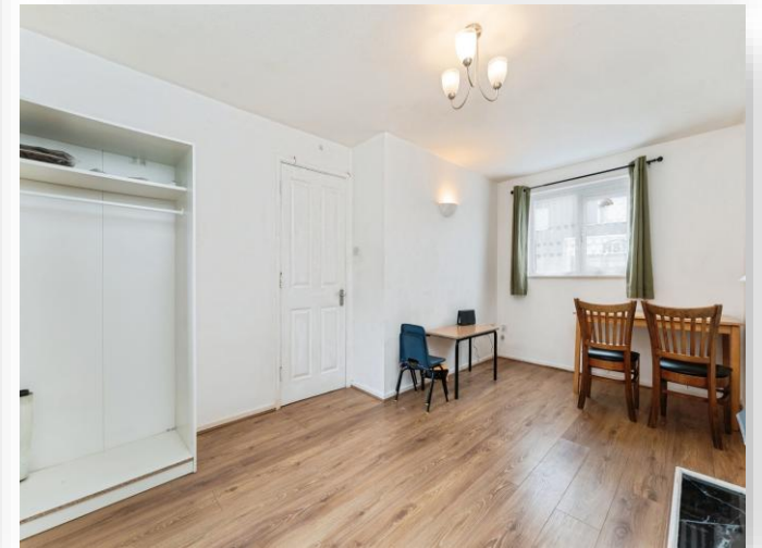
Mortons Court, March PE15 8LG