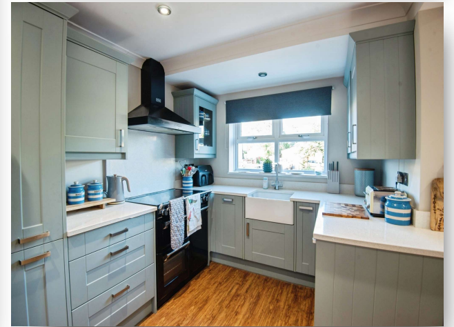
La-Fitou Mount Lane, Kirkby-La-Thorpe Sleaford NG34 9NR