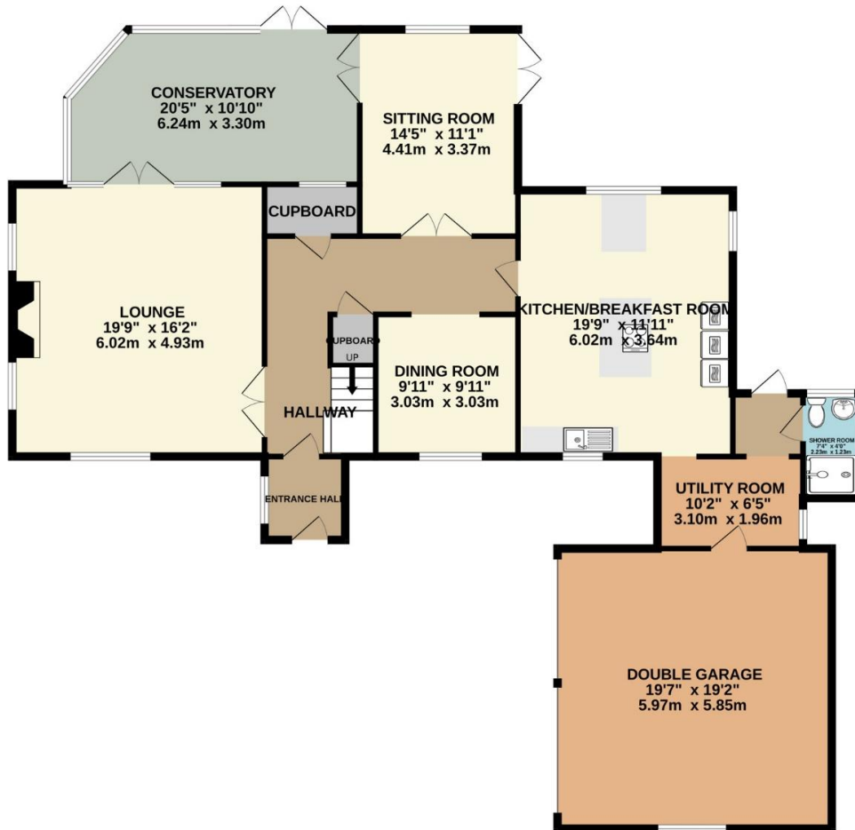
GROUND FLOOR 1801 sq.ft. (167.3 sq.m.) approx.