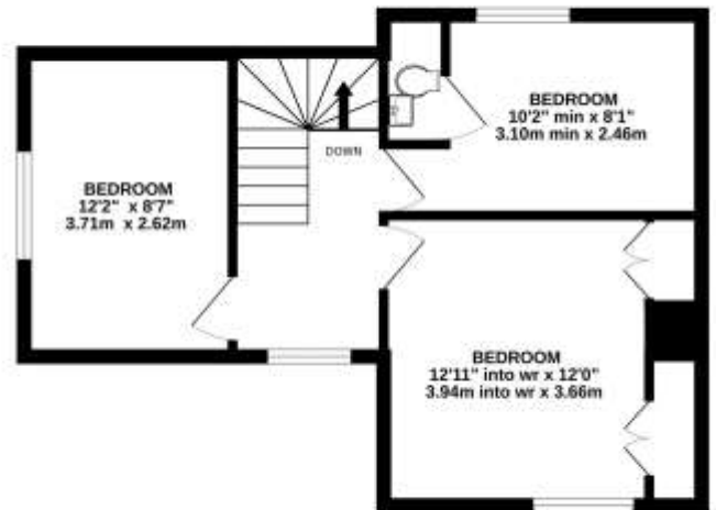
1ST FLOOR 411 sq.ft. (38.2 sq.m.) approx.

In order that we can assist you with your move as smoothly and efficiently as possible, our preferred Mortgage Adviser, can offer you advice on all your mortgage and protection needs, tailored to your individual circumstances. It will also be part of our qualifying process that you speak with our Mortgage Adviser when we ask the vendor to consider your offer. Your details may be passed onto third parties, please advise us if you do not wish this to happen.