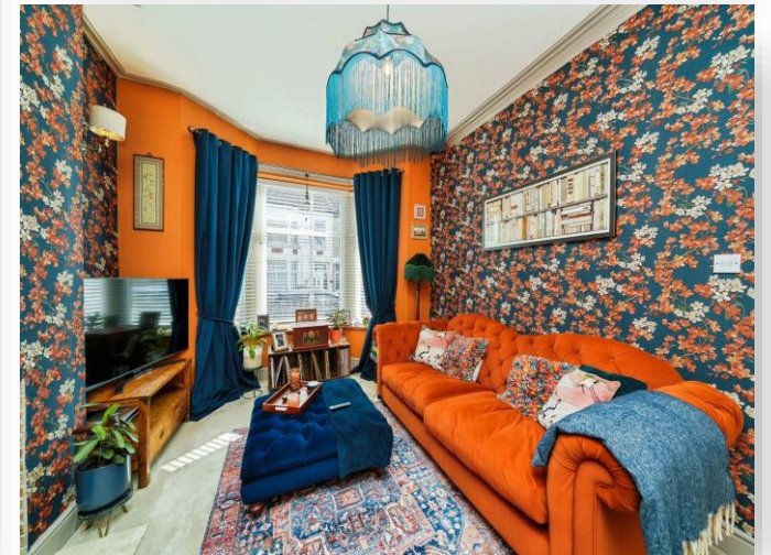
Clarence Road, Wallasey, CH44 9ET