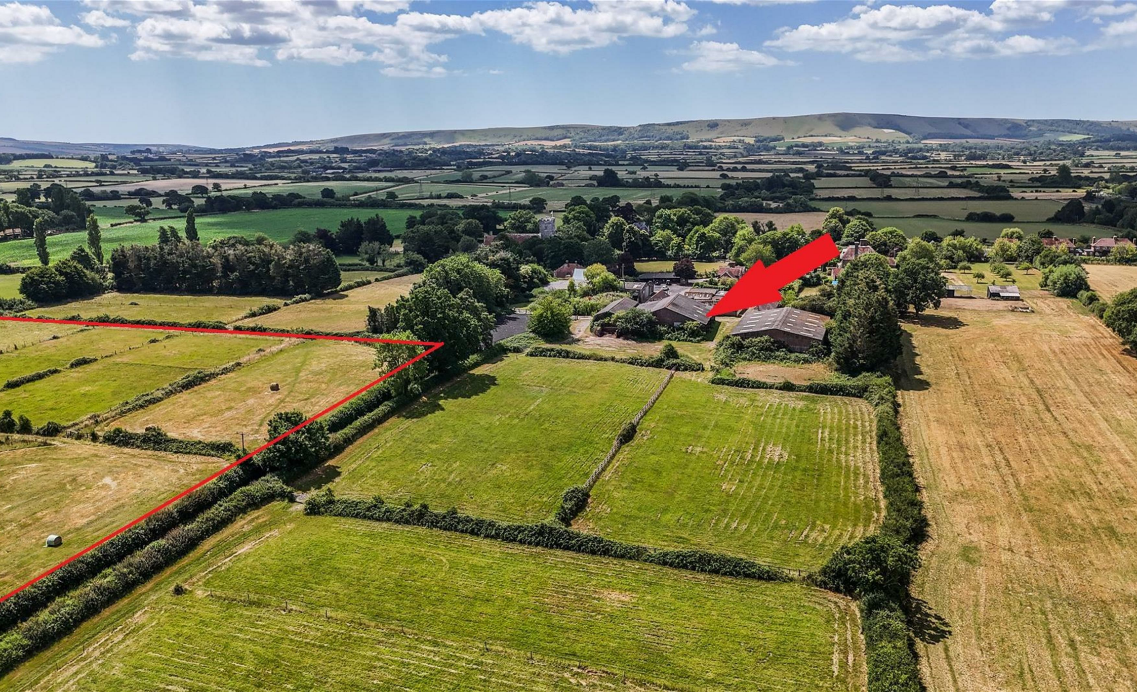
Church Farm Smallholding, Church Lane, Ripe, East Sussex, BN8 6AU