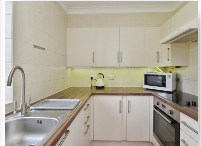
Lawnsmead Gardens, Newport Pagnell, MK16 8AY