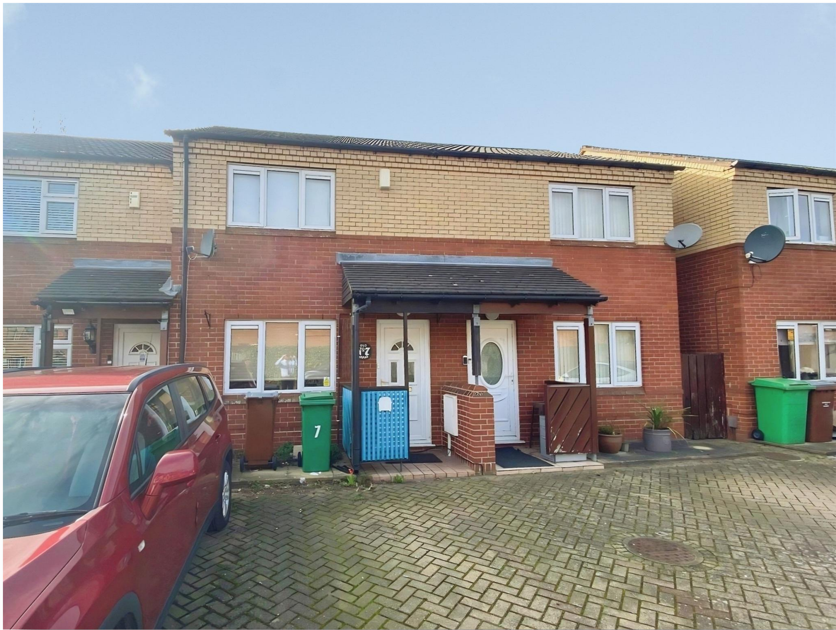
Bakers Close, Nottingham NG7 3AW