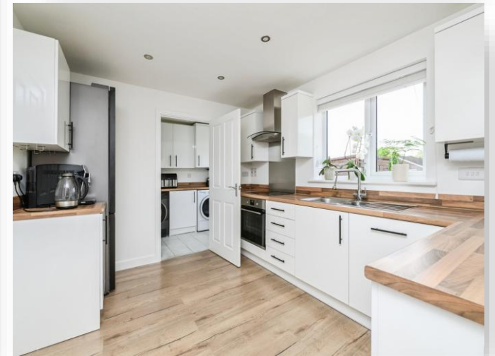
Hector Drive, Peterborough PE2 8XZ