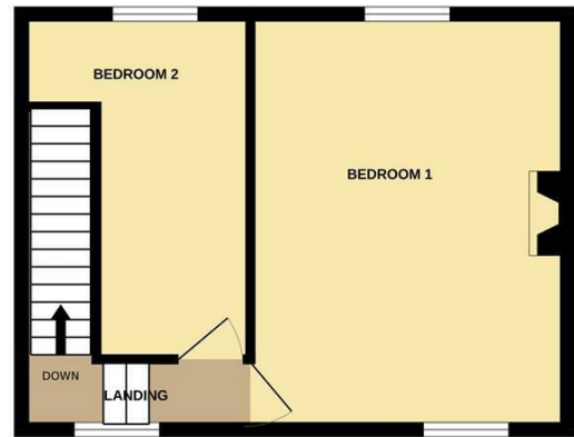
1ST FLOOR 339 sq.ft. (31.5 sq.m.) approx.