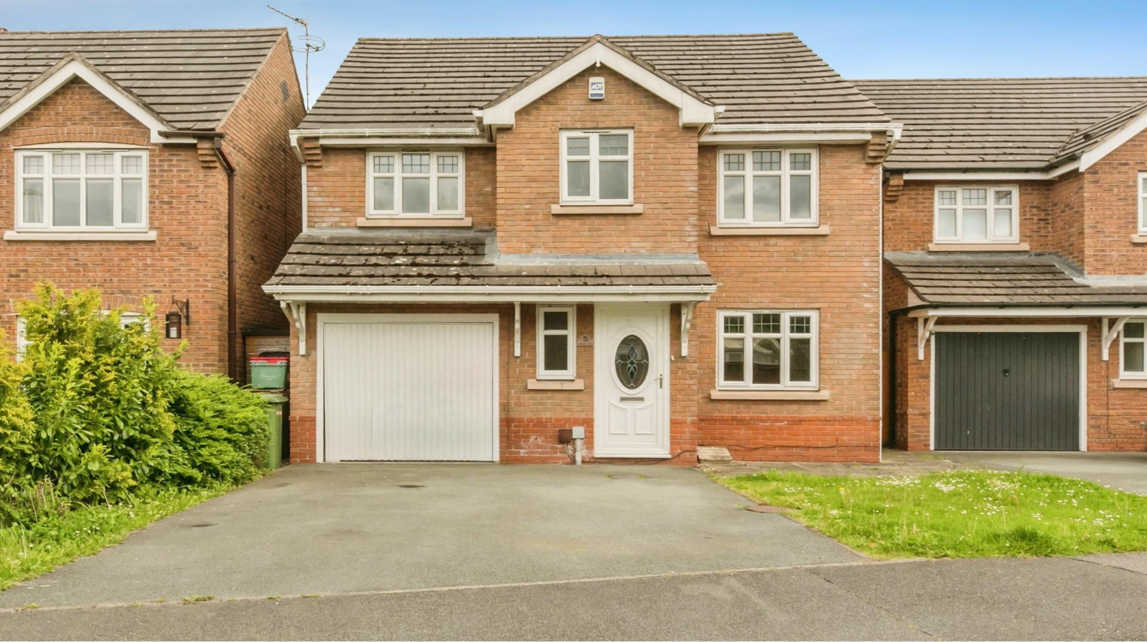
Hartwell Grove, Winsford CW7 3UR