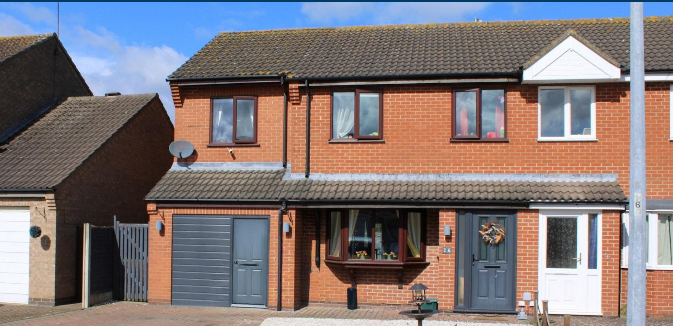
Maple Close, Brigg