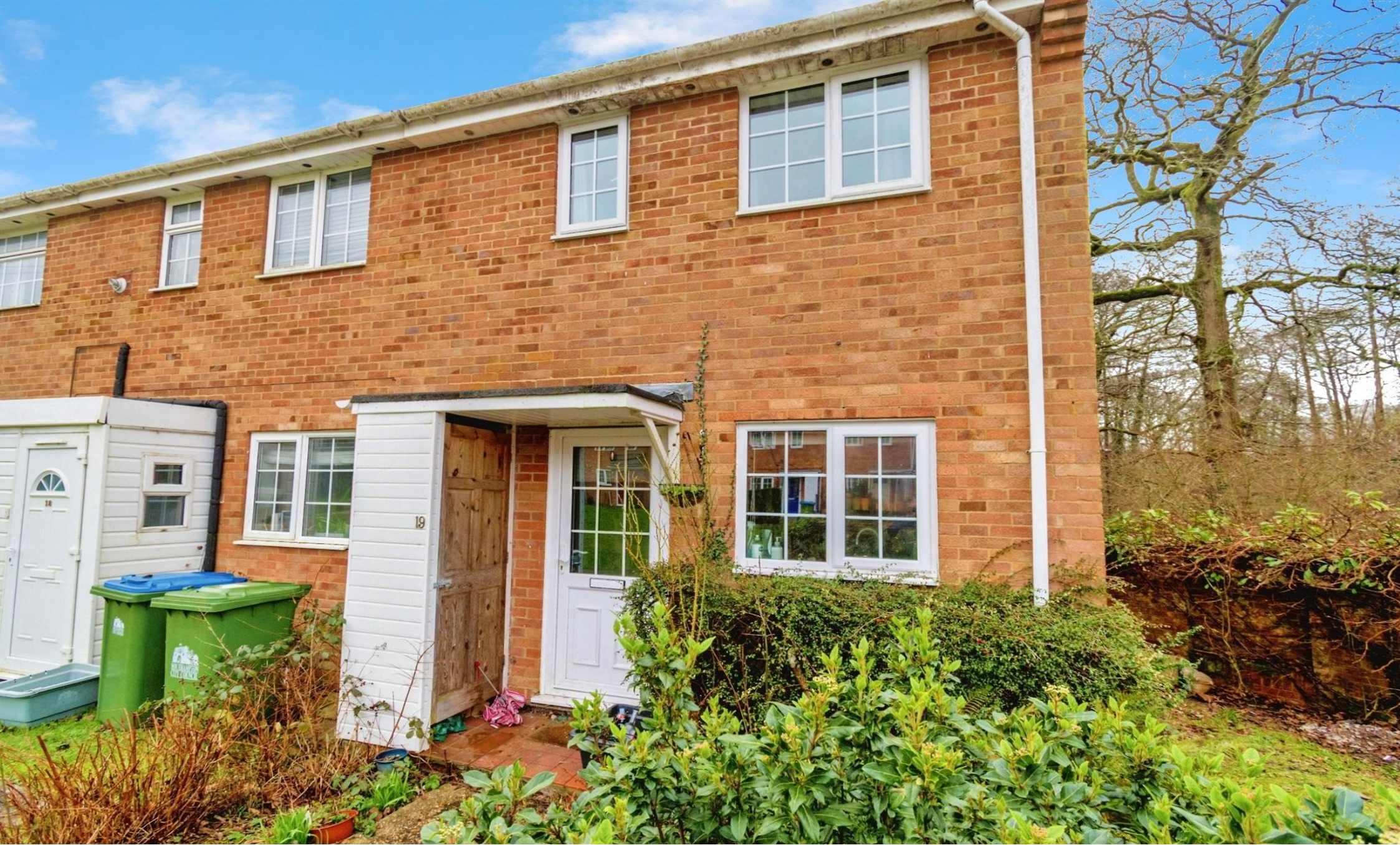
Goldcrest Gardens, Southampton SO16 8FG