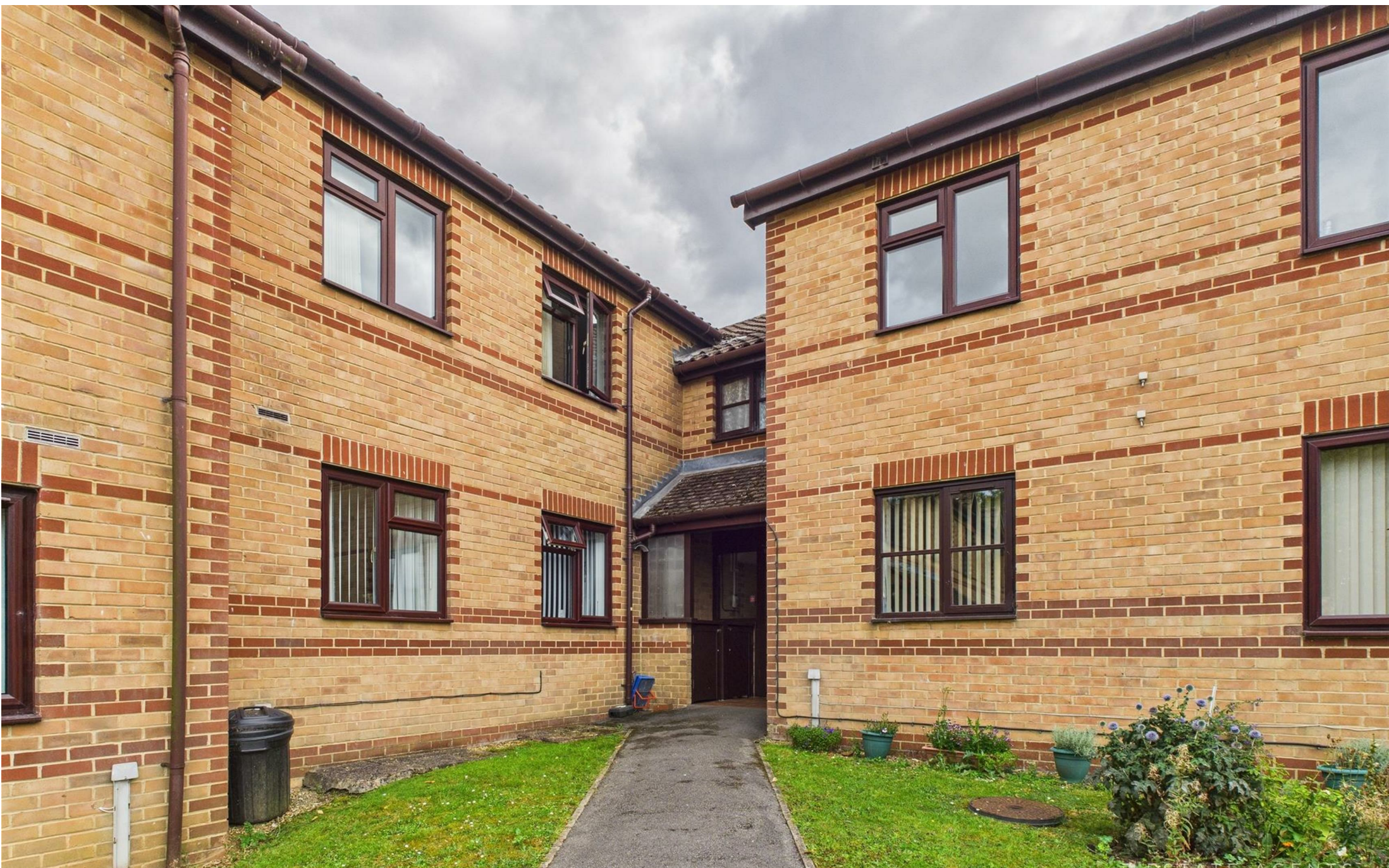
Gershwin Court, Brighton Hill, Basingstoke, RG22 4NN