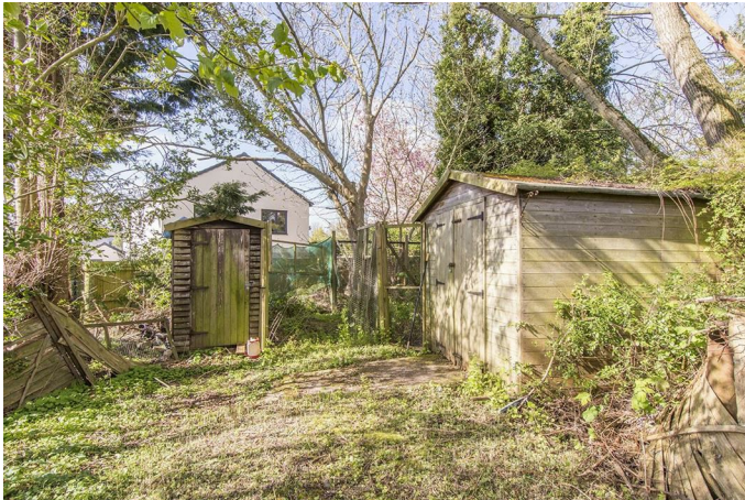
Utility Outbuilding 7'5" x 6'8" (2.26m x 2.03m)

Upon acceptance of an offer, all buyers will need to undertake an identification check for which there will be a charge of £50+VAT per person (non-refundable). These checks are completed to meet our obligations under Anti Money Laundering Regulations (AML) and are a legal requirement.