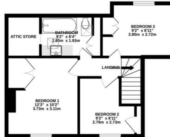
1ST FLOOR 429 sq.ft. (39.9 sq.m.) approx.