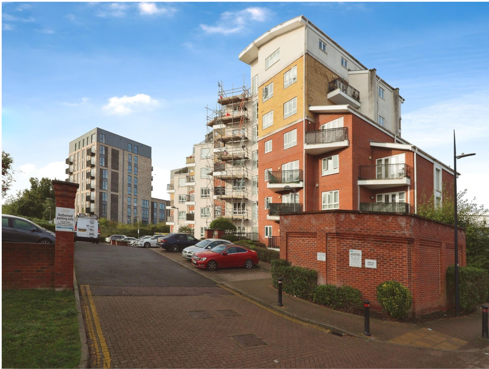
Omega Court, The Gateway, Watford, WD18 7HG