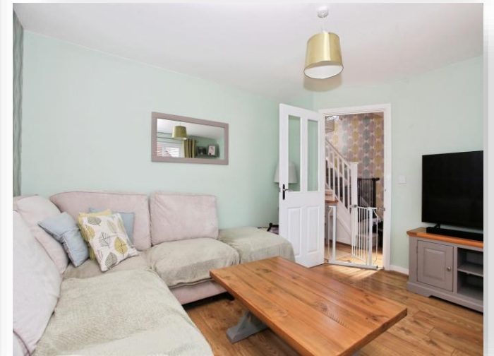
Magda Close, Stanground South Peterborough PE2 8WF