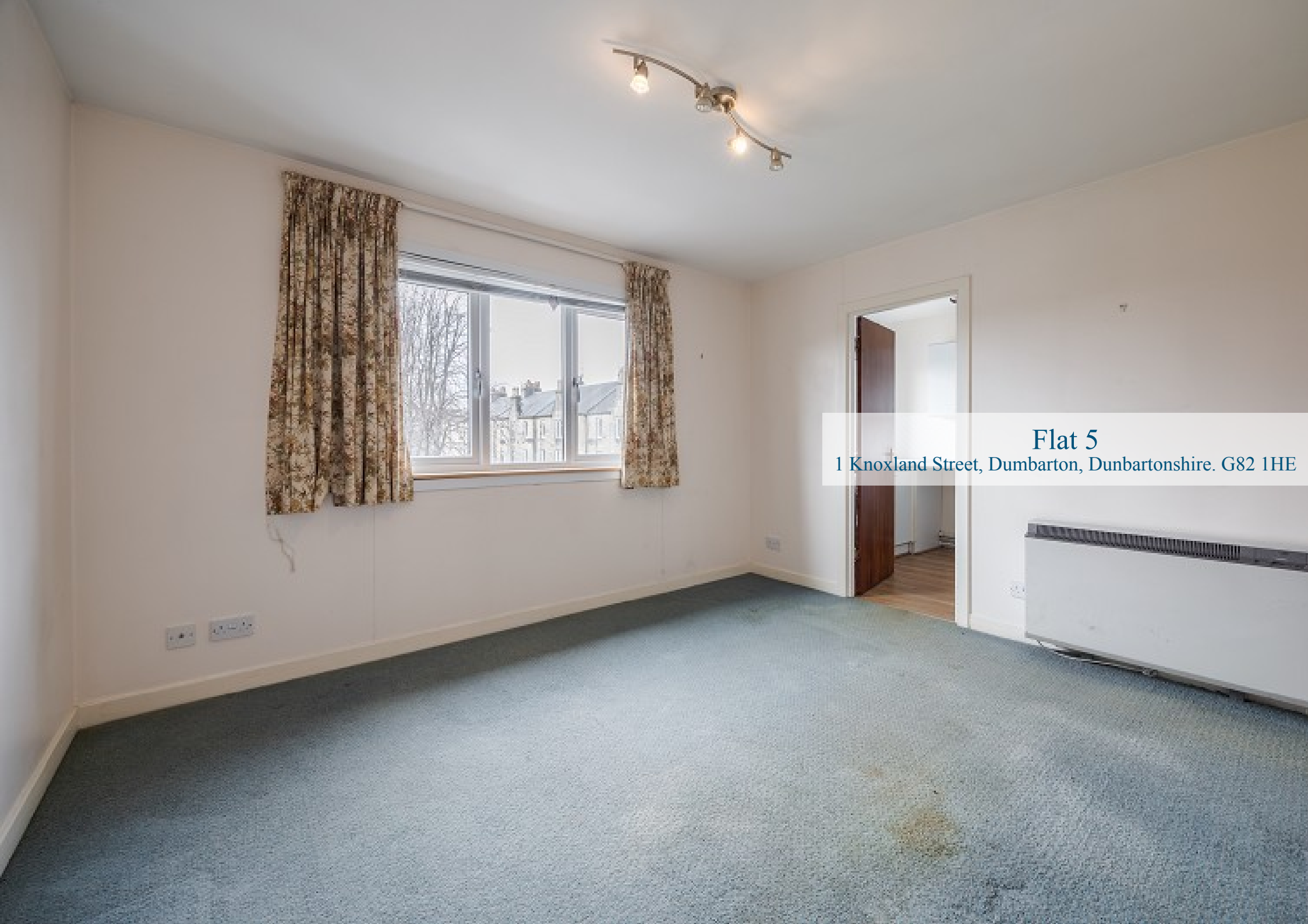
Flat 5 1 Knoxland Street, Dumbarton, Dunbartonshire. G82 1HE