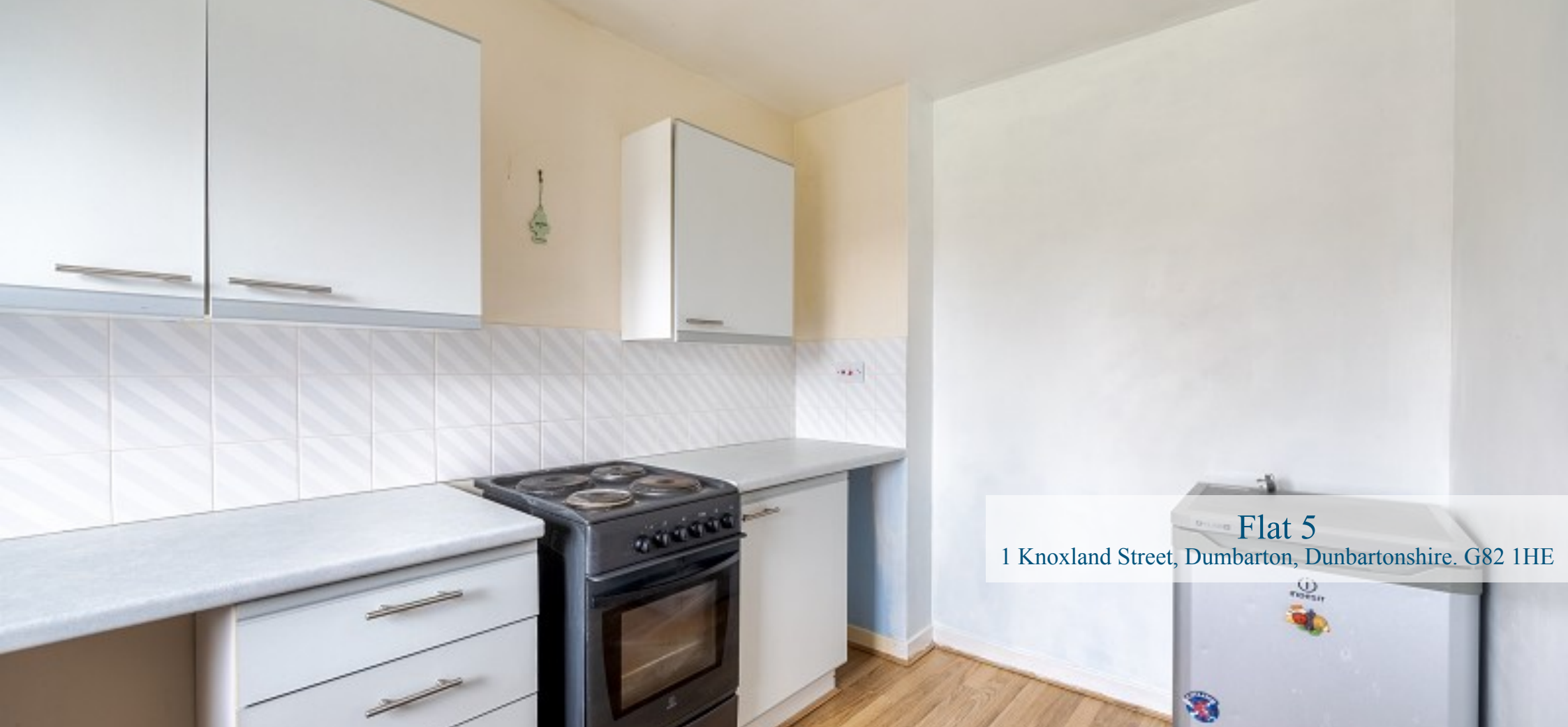
Flat 5 1 Knoxland Street, Dumbaron, Dunbartonshire. G82 1HE