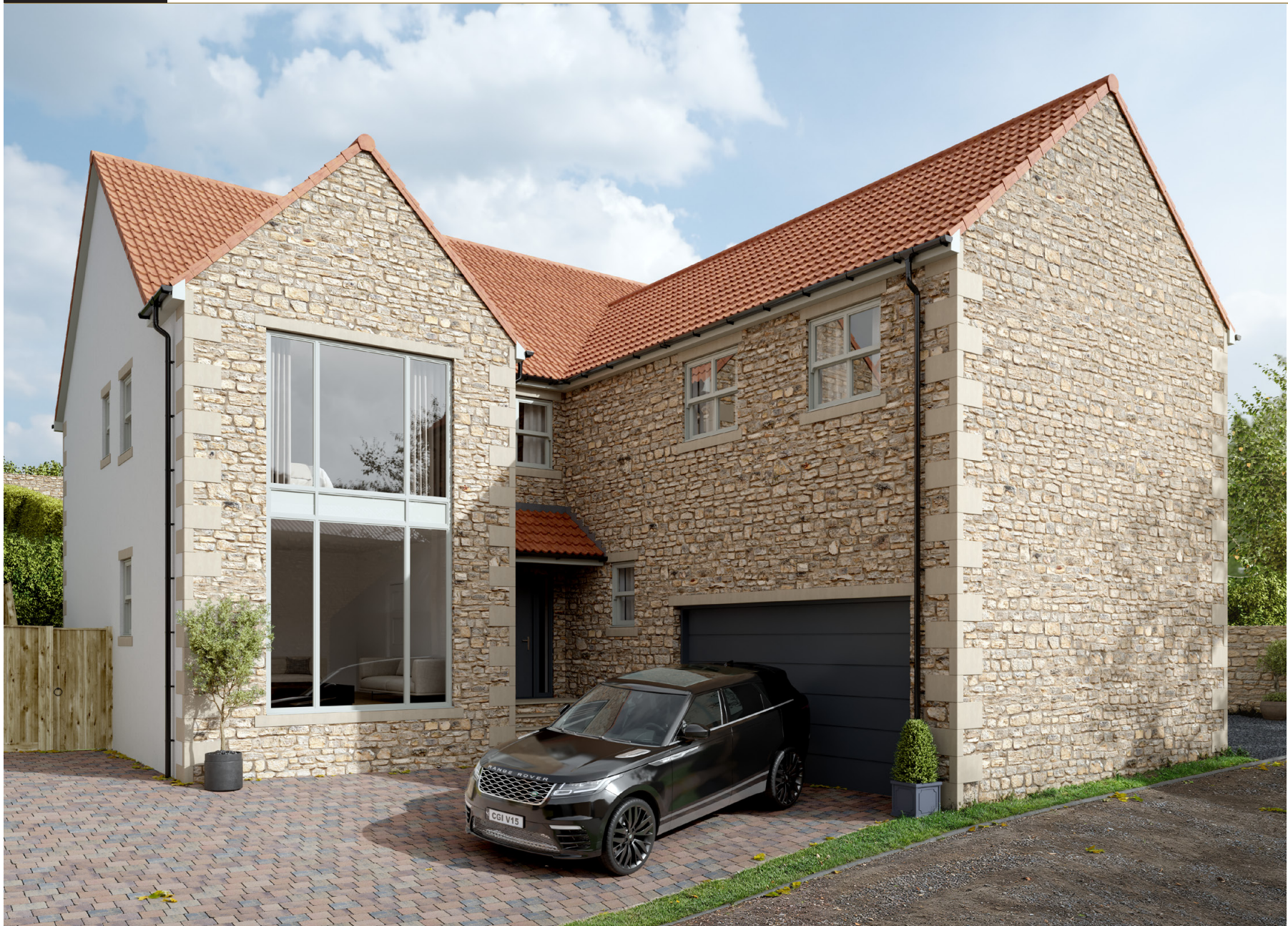
Computer generated imagery depicting the property.