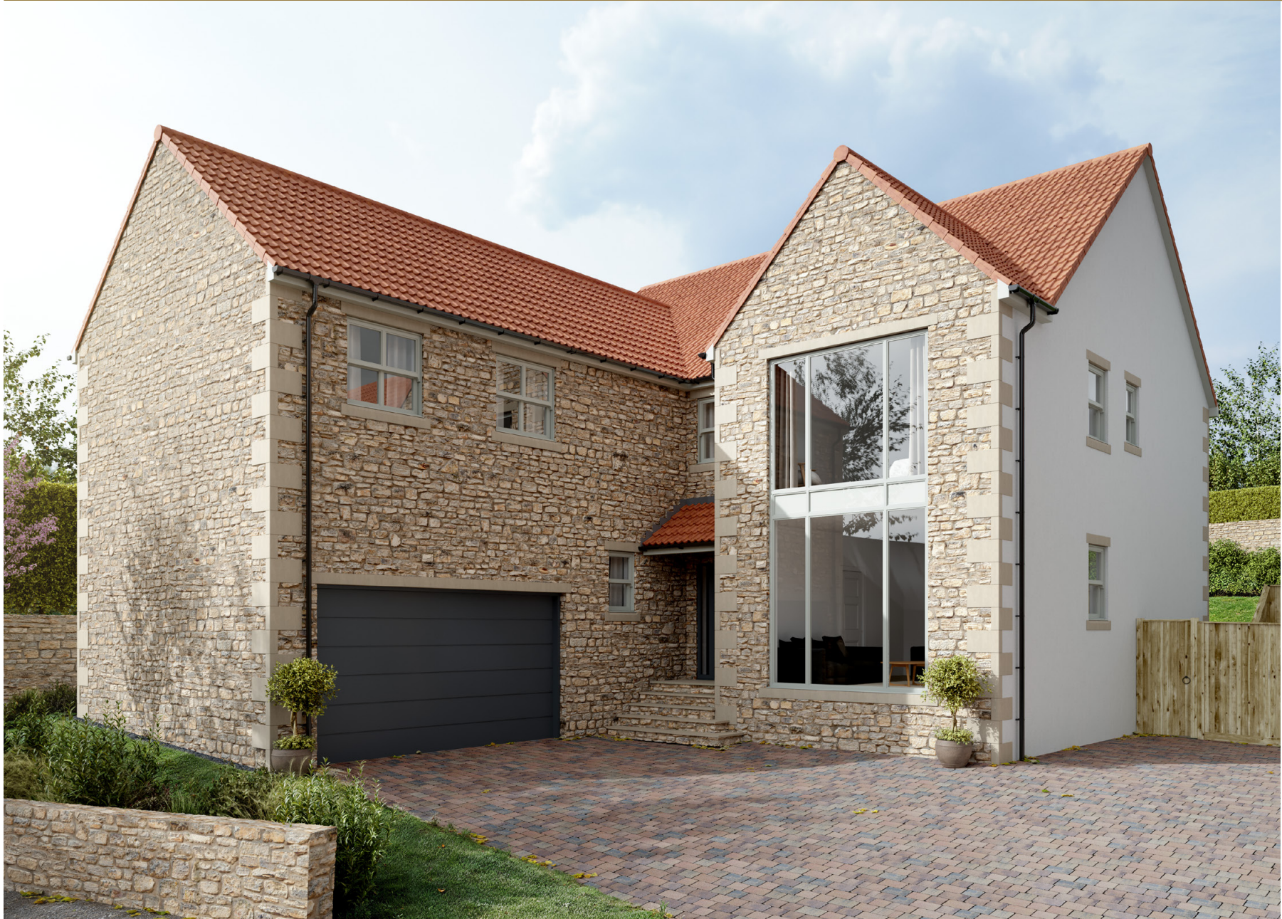
Computer generated imagery depicting the property.