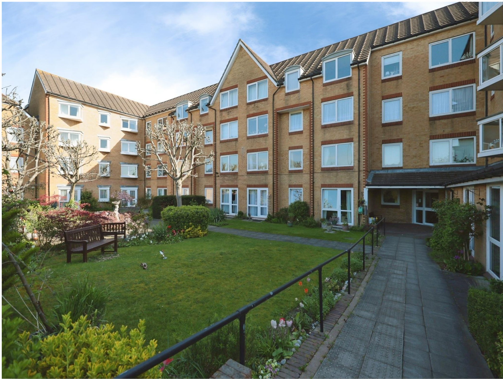
Homemanor House, Cassio Road, Watford, WD18 0QS