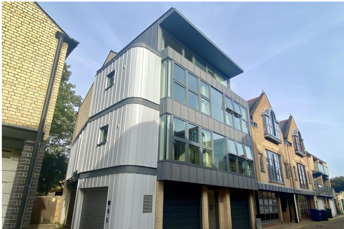
Cambridge Place, Hills Road