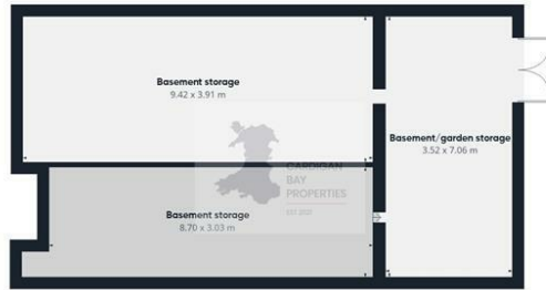
Floor -1 Building 1