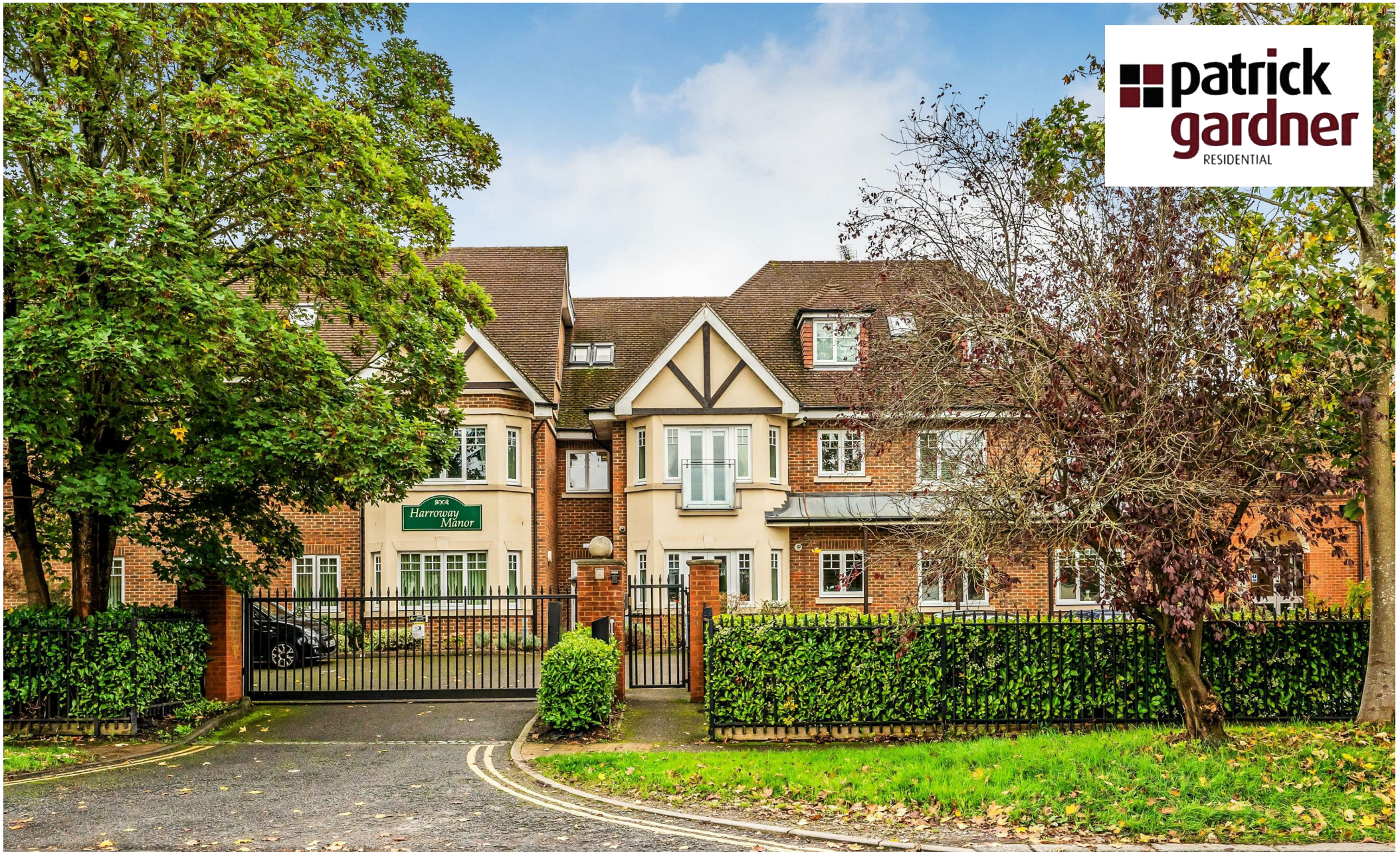
2 Harroway Manor, Cobham Road, Fetcham, Surrey, KT22 9LL