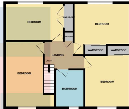
1ST FLOOR 658 sq.ft. (61.1 sq.m.) approx.