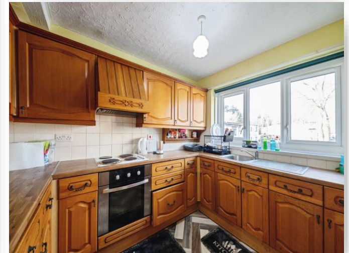
Durham Court Abdon Avenue, Birmingham B29 4PG