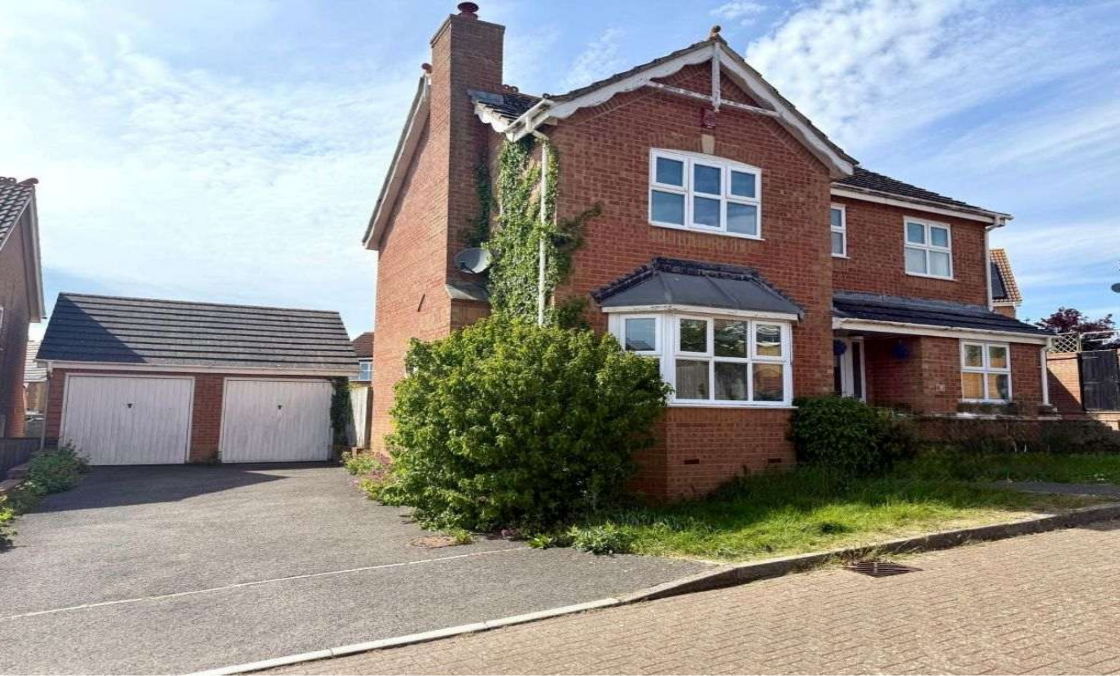
Ifield Mill Close, Stone Cross Pevensey BN24 5PF