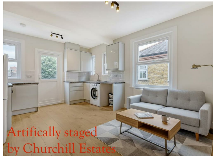
Artificially staged by Churchill Estates