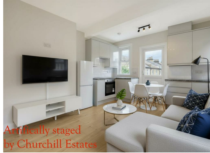
Artificially staged by Churchill Estates