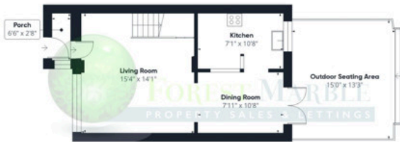
Ground Building 1