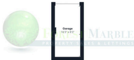
Ground Building 2