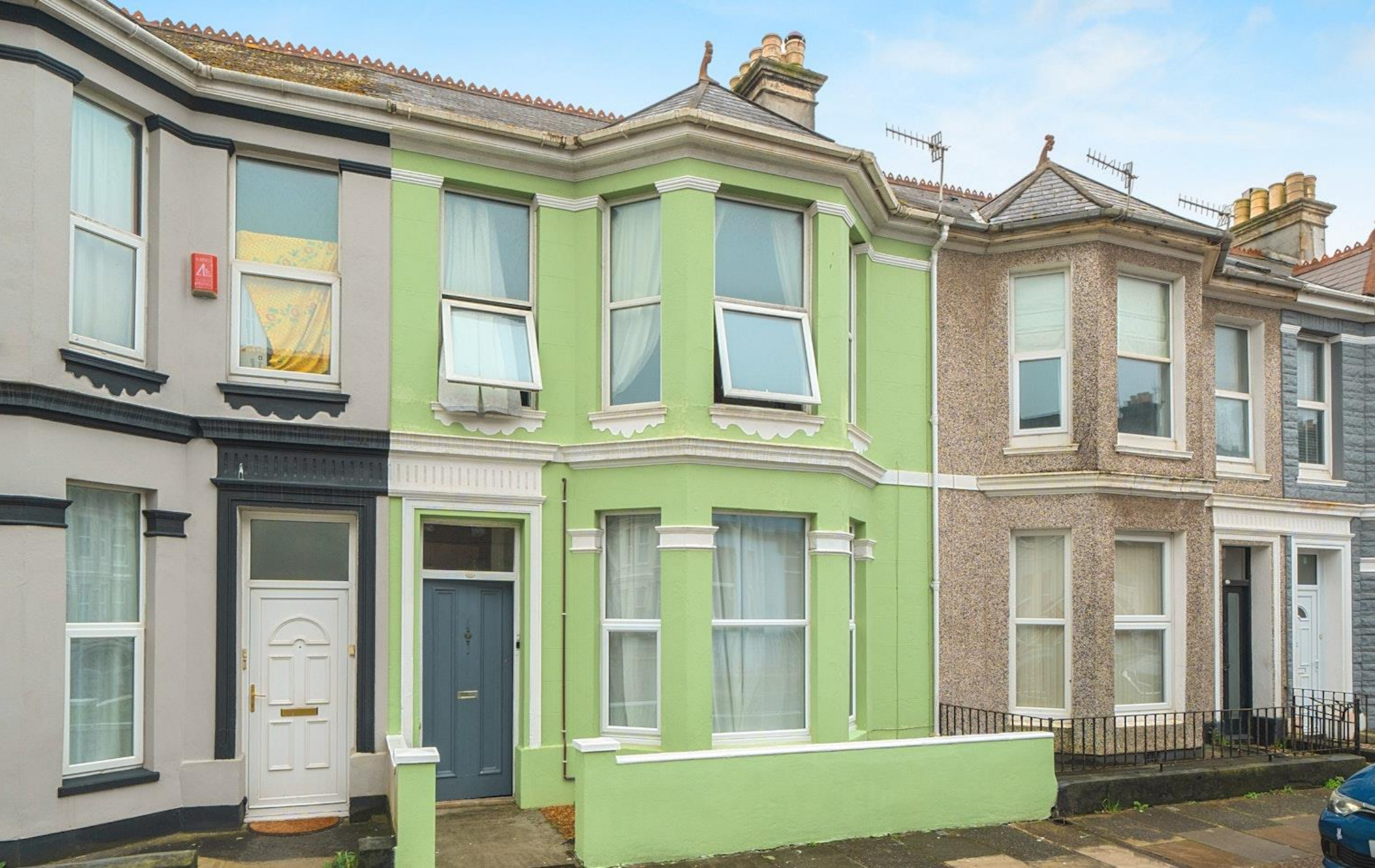
Cotehele Avenue, Prince Rock, Plymouth