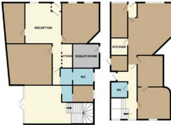
GROUND FLOOR 2372 sq.ft. (220.3 sq.m.) approx.