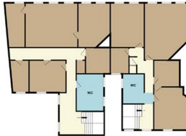
1ST FLOOR 2331 sq.ft. (216.5 sq.m.) approx.