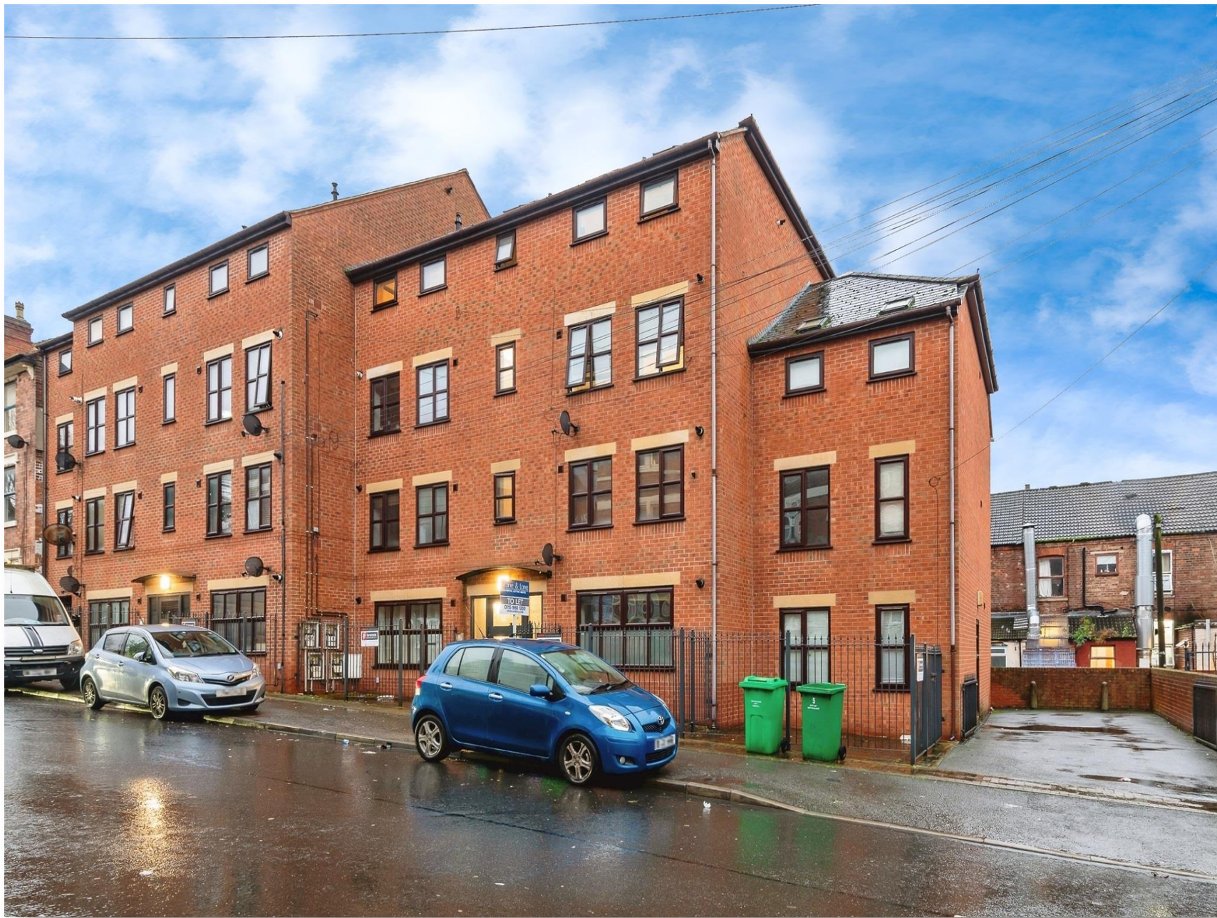
The Yard Sophie Road, Nottingham NG7 6AG