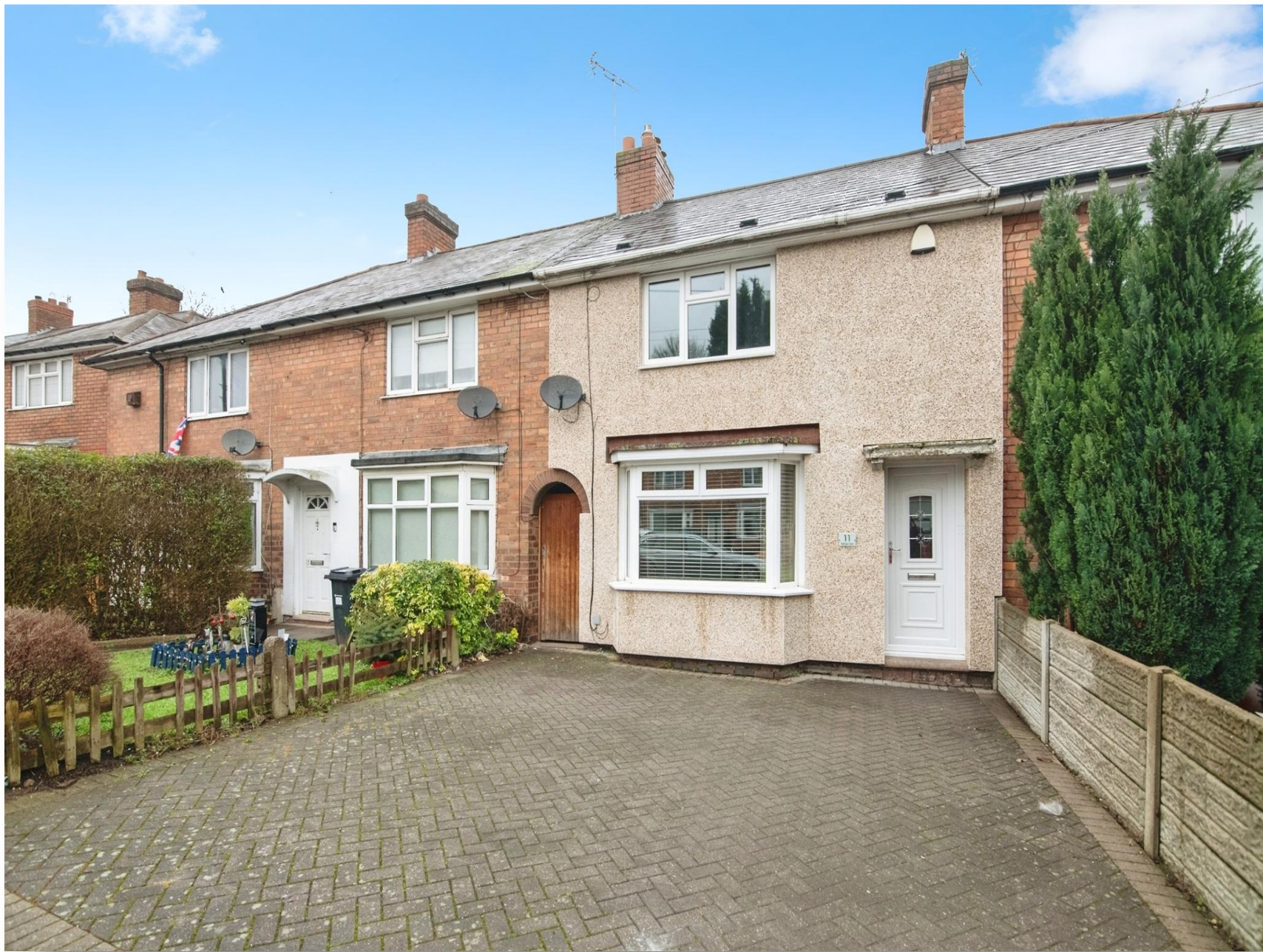
Sidcup Road, Kingstanding Birmingham B44 0LG