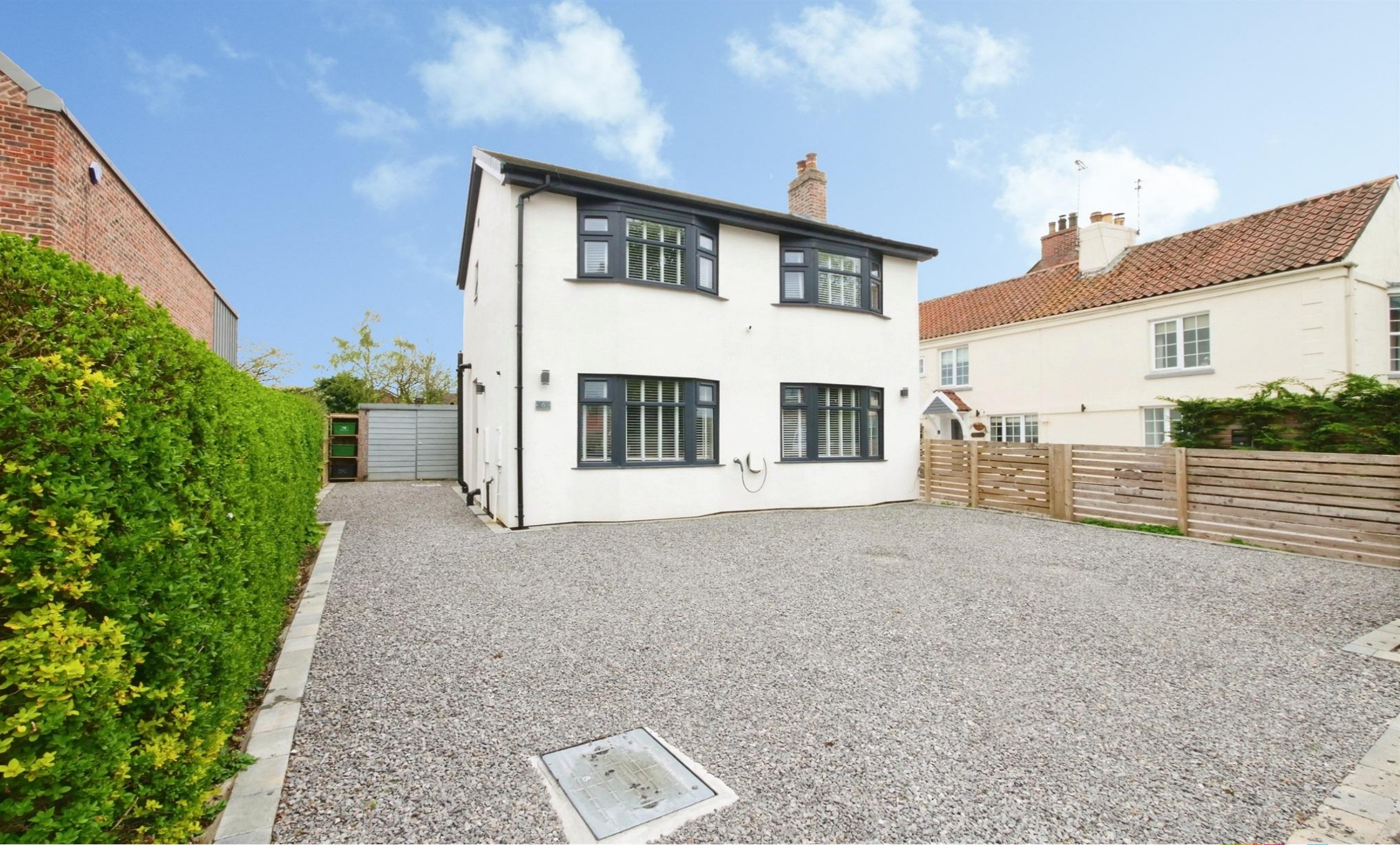
The Village, Strensall York YO32 5XS