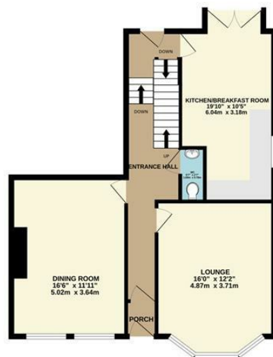
GROUND FLOOR 700 sq.ft. (65.1 sq.m.) approx.