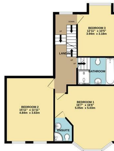
1ST FLOOR 703 sq.ft. (65.3 sq.m.) approx.