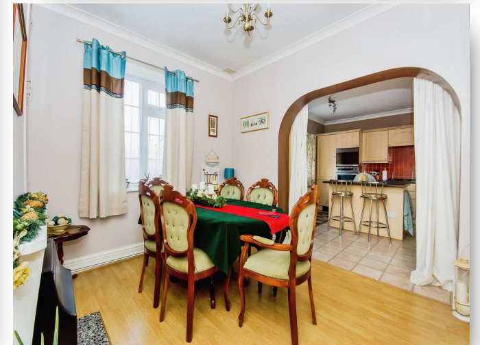
Rectory Road, Ruskington Sleaford NG34 9AA